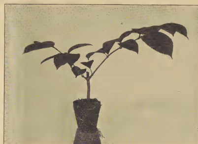
THE ROOT'S THE THING!

Improve your stands; tie to this grade of young stock; you'll always be ahead and satisfied .